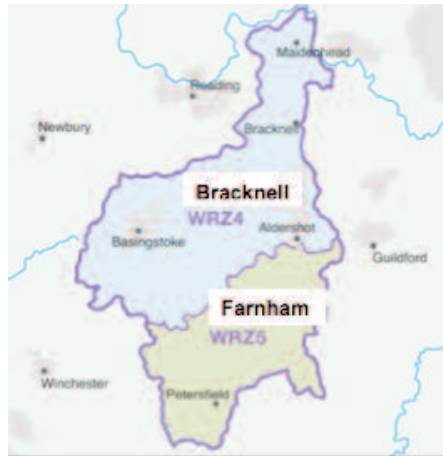
West Region: WRZs 4 and 5