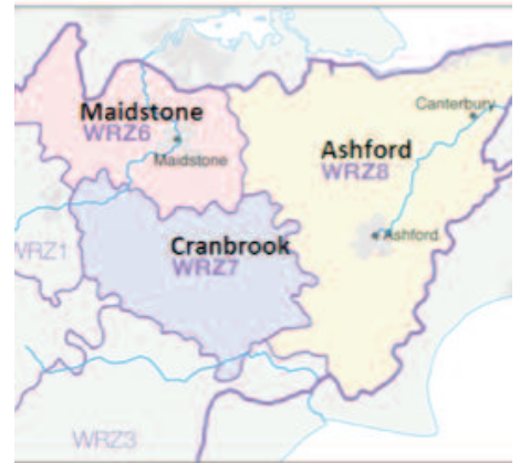
East Region (Kent): WRZs 6, 7 and 8

As illustrated above, public water supplies in north east Hampshire and neighbouring parts of Surrey are provided by South East Water (SEW). Hart District and the eastern part of Basingstoke & Deane are within South East Water's 'Bracknell' Supply Zone – Water Resource Zone 4 (WRZ4).