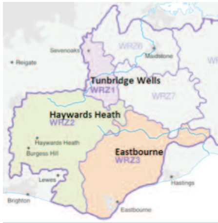
East Region (Sussex): WRZs 1, 2 and 3