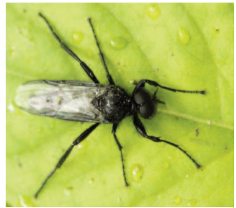
Pictured: Male St Mark's fly – the female has a smaller head and eyes

So what do St Mark's Day, compost heaps and nectar actually have in common?